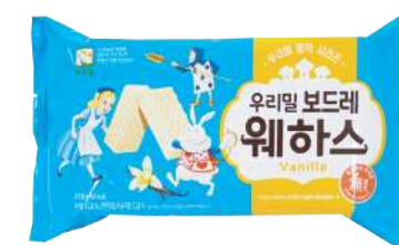
Woorimil Wafers (Vanilla) 웨하스 (바닐라)

The soft texture of germinated whole wheat, the nutty taste of Korean strawberries, and fertilized eggs.