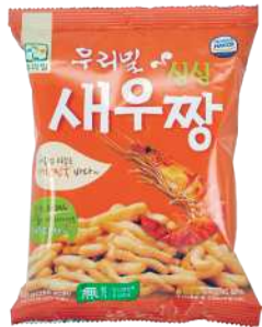
Woorimil Shrimp Snack 새우짱

Shrimp snack made with fresh Korean shrimp and sweet potato starch.