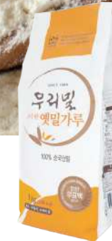
Whole wheat flour 통밀가루 Korean whole wheat packed with a nutty flavor and rich nutrition.