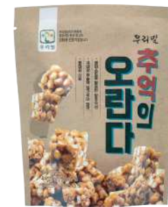
Woorimil Oranda Snack 추억의 오란다

Main ingredients comprised of potato starch, mashed potatoes, and potato flakes, and the rich savory is flavored with Korean brewed and conventional soy sauces.