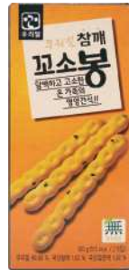
Woorimil Sesame Stick Cookies 참깨꼬소봉

Nutritious biscuit made with pesticide-free Korean wheat, rice, and other six organic vegetables.