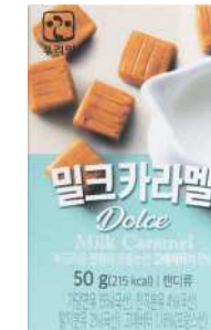
Milk Caramel Dolce 밀크카라멜 돌체

Delicate savory perfect for kids. Made from premium ingredients such as Korean condensed milk and organic sugars.