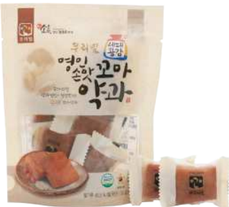
Korean Traditional Cookie 명인손맛 고마약과

Premium stacked snack made of Korean sesame, unsalted butter, and organic sugar.