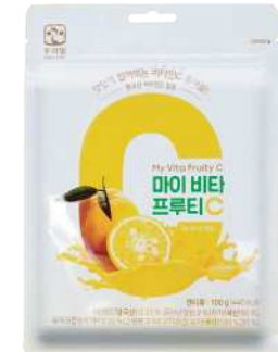
My Vita Fruity C 마이비타프루티 C

Sweet caramel containing sugary and soft-textured Korean condensed milk and flavorful French gourmet butter and organic sugar.