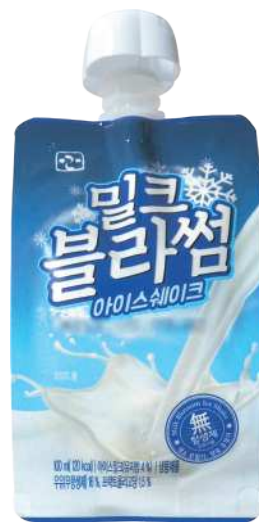
Mik Blossom Ice Shake 밀크블라썸 아이스쉐이크 Premium ice shake made from antibiotic-free Korean condensed milk.