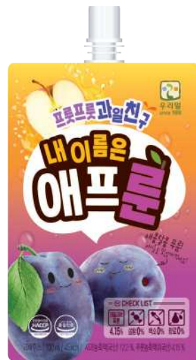
Kids Drink (Apple & Prune) 내이름은 애플프룬 Unsweet blended juice of fresh apples, prunes, and quince.