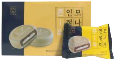
Korean glutinous rice monaka 인절미모나카

Pastry-formed, traditional Korean refreshments made by a famous Korean rice snack master.