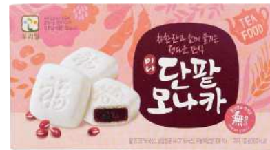
Mini Sweet redbean Monaka 미니단팥모나카

Additive-free snack made with premium ingredients such as Korean rice bran oil, organic sugars, and Korean butter.