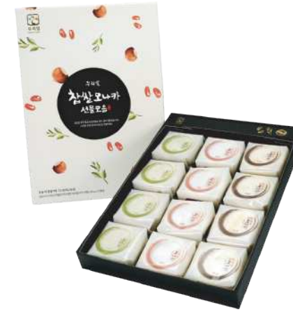
Glutinous rice monaka set

Sand dessert with Korean black sesame in soft and sweet cookies Sand dessert with Korean green tea powder between soft cookies