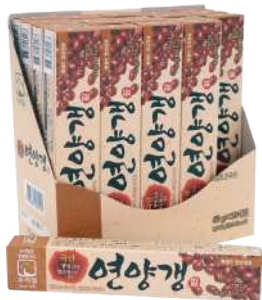
Sweet Red-bean JELLY 연양갱(팥)

Sweet Monaca with Injeolmi-flavored paste in a wrapper made with Korean glutinous rice flour and flour.