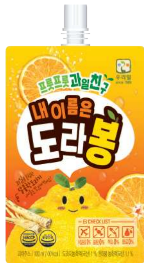
Kids Drink (Bellflower & Hallabong) 내이름은 도라봉 Bellflower root and Hallabong tangerine concentrated juice for children.