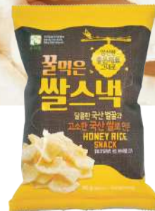
Honey Rice Snack 꿀먹은 쌀스낵

A nutty and crispy chip snack made with premium Korean corn and rice.