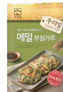
Woorimil buckwheat flour mix 메밀부침가루 Buckwheat spicy flour added with crispy and elastic domestic buckwheat.