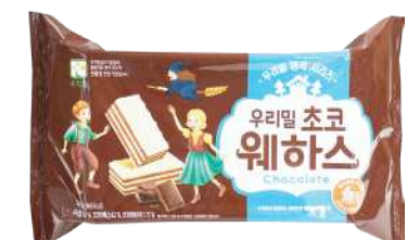
Woorimil Wafers (Choco) 웨하스 (초코)

Germinated whole wheat with natural vanilla flavor for unsweet taste and tender texture.