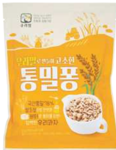
Woorimil whole wheat confection 통밀퐁

Squid peanut ball with a special flavor, including Korean peanuts, organic sugar, and dried shredded squid.