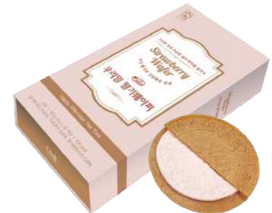
Woorimil Wafer (Strawberry) 우리밀 웨이퍼(딸기)

Mini bite, red bean Monaca made in a Korean traditional way for crispy texture outside and chewy inside.