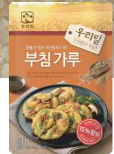
Woorimil Pancake mix 부침가루 Crispy and nutty pancake powder containing Korean potato starch and rice flour.