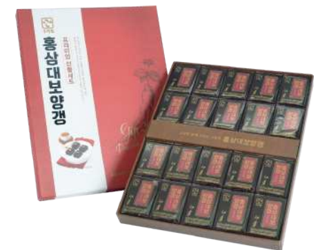
Korean Red-ginseng Sweet Jelly

Rice cracker gift set made with pesticide-free Korean wheat and packed with three flavors of black sesame, ginger, and seaweed.