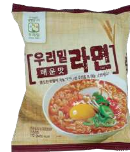
Woorimil Ramen (Spicy)

Pesticide-free oatmeal made by compressed oats grown in Korea.