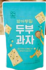
Tofu Snack 두부과자

A dye-free and chemical additive-free additive snack made with pesticide-free soybeans and germinated whole wheat for a nuttier taste.