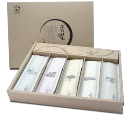
Woorimil 5-Colors noodle set

Korean traditional glutinous rice Monaka gift set with a crispy texture outside and chewy.