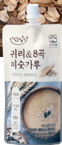
Gruel (Oats & Grains)

Drinking porridge for a quick breakfast made with Korean sweet pumpkin.