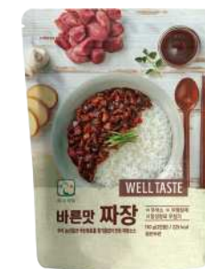
Woorimil Black Bean Curry (Jajang)

Curry sauce made from Korean ingredients with no additives such as colorant, leavening agents, synthetic flavors.