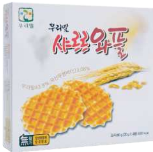
Woorimil Waffle Chip 샤르르와플

Home-made, crispy snack with Korean brown rice and black beans and baked in the oven.