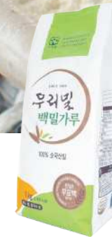
White wheat flour 백밀가루 Korean white wheat without pesticide residues.