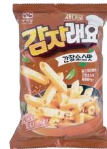
Korean Potato Snack (Soy Sauce) 감자래요 (간장소스)

Main ingredients comprised of potato starch, mashed potatoes, and potato flakes and seasoned with gorgonzola and blue cheese powder.