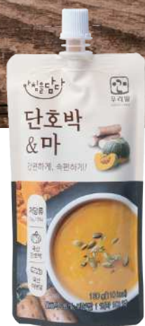
Gruel (Sweet Pumpkin & Yam)