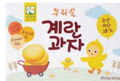
Woorimil Egg Snack 계란과자

Nutritious snack for children with Korean barley and sesame upgrading the flavor.