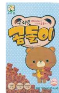
Kids Bear Snack 곰돌이

Traditional Korean cookie made with pesticide-free, Korean wheat.