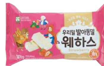
Woorimil Wafers (Strawberry) 웨하스 (딸기)

Citrus-flavored caramel containing Korean citron and British vitamin C.