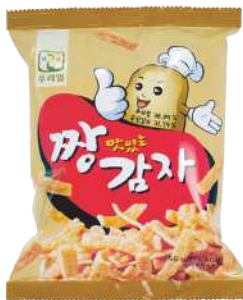
Korean Potato Snack 짭맛있는 감자

Cereal snack made of Korean whole wheat, rice syrup(jochong), and butter that is eaten by pouring into milk.