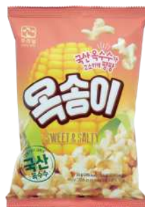
Korean Corn Flower Snack 옥송이

Kid-friendly snack coated with Korean rice syrup and package decorated with children's favorite characters.