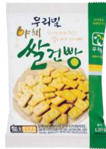
Woorimil Veggie rice Hardtack 야채쌀견빵

Soft and nutty biscuit made with Korean germinated whole wheat powder and stirred barley powder.