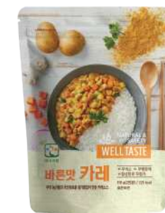
Woorimil Curry (Original)

Potato dumpling made by Korean potato that achieved vegan certification.