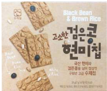
Black bean Brownrice Chip 검은콩 현미칩

Shrimp snack made with fresh Korean shrimp and sweet potato starch.