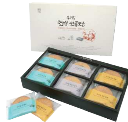
Woorimil Pancake giftset

Korean Specific noodle set containing nutrients and five colors of traditional Korean wheat flour.