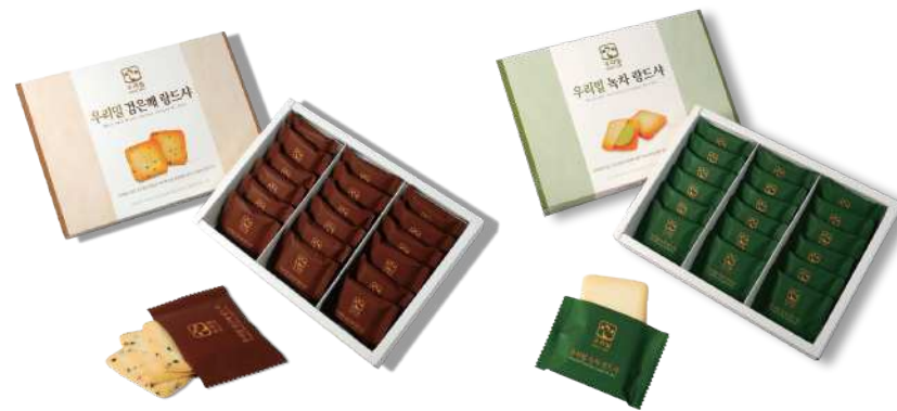
Woorimil Sand dessert cookies set 우리밀 참깨 랑드사 / 우리밀 녹차 랑드사

A gift set of extracted black ginseng concentrate that has been steamed and dried 9 times, added with Korean sugar-fed honey