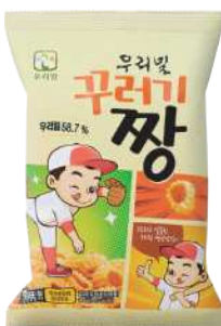
Jjangu Snack 꾸러기짱

Made with sweet Korean honey and nutty Korean rice, with no use of synthetic flavoring and coloring agents.