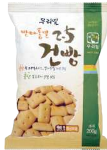
Woorimil 2.5 Hardtack 2.5견빵

Tender waffle cookies made of Korean butter and fertilized eggs.