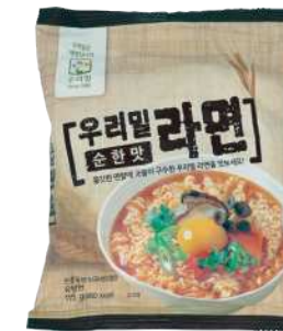
Woorimil Ramen (Mild)

Woorimil Ramen adds red pepper and garlic to the broth brewed with Korean kelp and Shiitake mushroom.