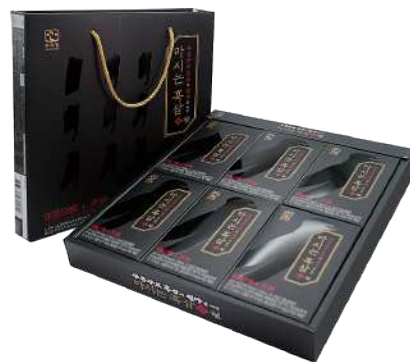
Korean black ginseng drink set 마시는 흑삼현 세트

A gift set of extracted black ginseng concentrate that has been steamed and dried 9 times, added with Korean sugar-fed honey