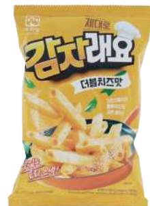
Korean Potato Snack (Double Cheese) 감자래요 (더블치즈)

Puff snack seasoned with a sweet and delicate seasoning that is savorily pumped with Korean corn.