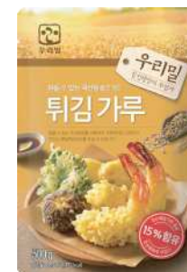
Woorimil powder mix for frying 튀김가루 Crispy and nutty fried powder containing Korean potato starch and rice flour.