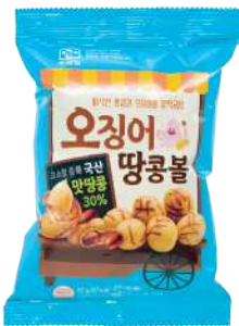
Woorimil Squid & peanut ball 오징어땅콩볼

Wafer harmonizing the freshness of Korean strawberry and sweet milk cream.