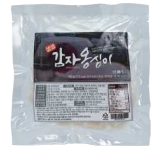
Korean Potato Ongshimi

Woorimil ramen boasts a delicate flavor of a broth brewed with Korean kelp and Shiitake mushroom.