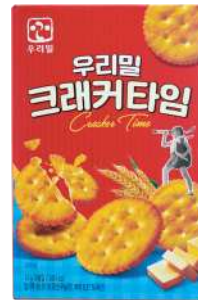
Woorimil Cracker Time 크래커타임

Sweet red bean jelly made of Korean red beans with no preservatives, colorant, and synthetic flavors.