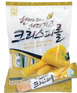
Cheddar cheese Crispyroll 현미로만든체다치즈크리스피롤

Wafer packed with vanilla flavor in sweet milk cream.