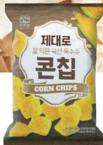
Korean Corn Chip 제대로 콘칩

A dye-free and chemical additive-free additive snack made with pesticide-free soybeans and germinated whole wheat for a nuttier taste.