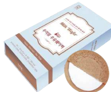
Woorimil Wafer (Vanilla) 우리밀 웨이퍼(바닐라)

Crunchy and savory snack made from Korean pesticide-free potatoes.